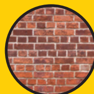
Brick & Stone

Excellent R-Value: 5.66 per inch and thermal insulation value 0.025W/(m.k)